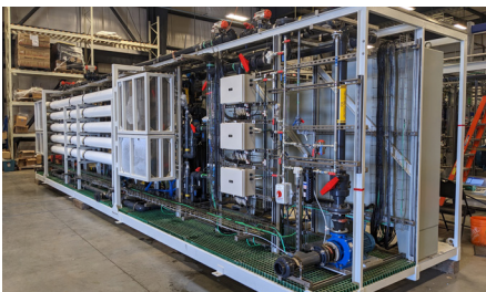
Xtreme-RO process unit

Treat inlet water to reduce total dissolved solids (TDS) and chlorides to boost evaporative cycles. Treating evaporative cooling blowdown or reverse osmosis (RO) brine necessitates advanced expertise to address the presence of complex organics and scaling ions. Our engineers will work with your team to assess processing options, and economic analysis of alternatives.