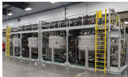
BrineRefine stir-tank reactor