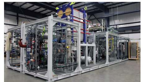
SaltMaker evaporative crystallizer