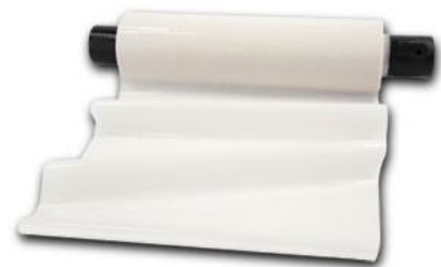
Saltworks' IonFlux Ion Exchange Membranes