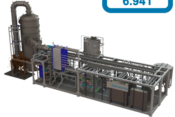
Heat Exchanger: Shell and tube or plate and frame